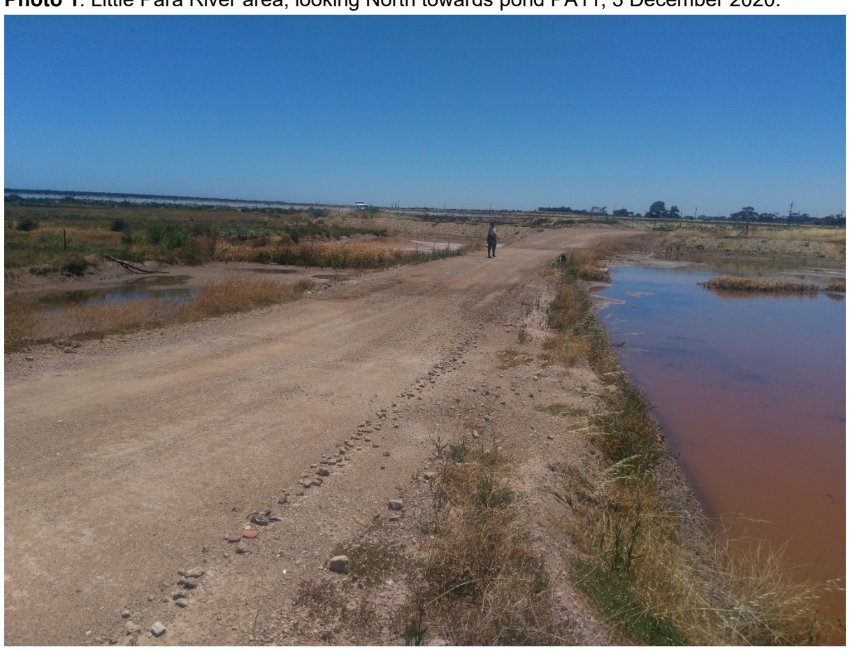
Photo 1 : Little Para River area, looking North towards pond PA11, 3 December 2020.