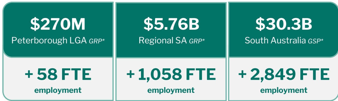
Figure 3. Total (direct and flow-on) economic activity and employment by selected region – operations phase (30-year mine life at 5Mtpa)

* Gross Regional Product (GRP) and Gross State Product (GSP) are measures of economic activity, in dollar terms, flowing through the region/state. FTE refers to Full-Time Equivalent jobs.