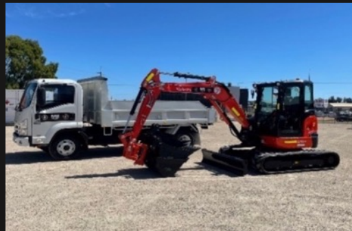
2021 KUBOTA U48 EXCAVATOR WITH TILT HITCH