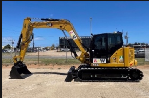
2020 CAT 308 EXCAVATOR