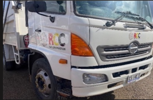
2008 HINO TANDEM AND 10,000L WATERCART