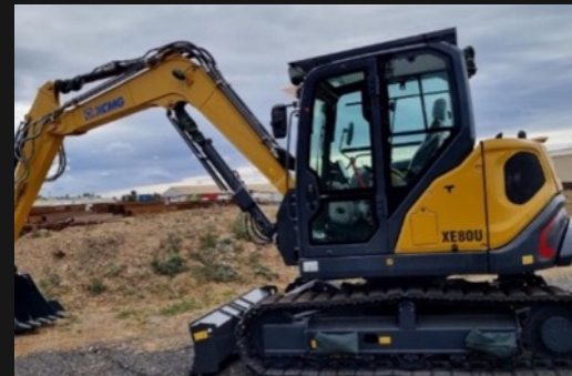
XCMG 8T EXCAVATOR WITH TILT HITCH AND RUBBER TRACKS