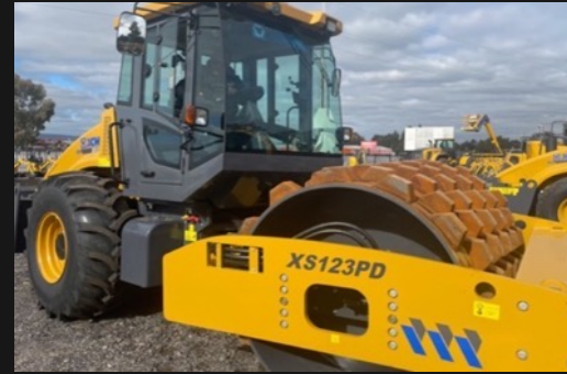
2021 XCMG 12.5T PAD FOOT