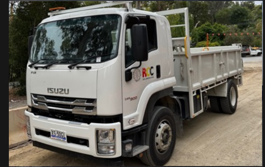
2 X 2021 ISUZU 9T TIPPERS