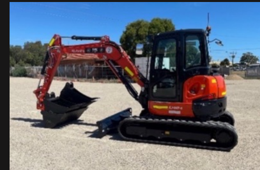
2021 KUBOTA U35 EXCAVATOR WITH AUGERS