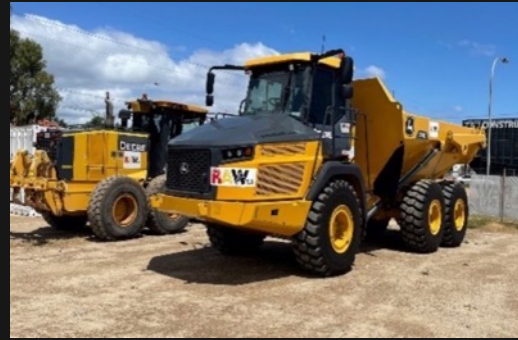
2 X 310E HAUL TRUCKS 1 X 872 GP GRADER