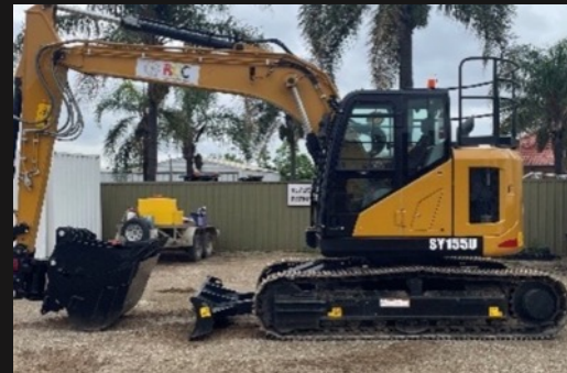
2022 SANY 15.T EXCAVATOR WITH TILT HITCH