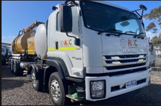
2018 ISUZU FYJ-9000L MEGA VAC UNIT TRUCK BASE DOT