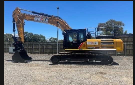
2022 SANY 36T EXCAVATOR 4300KG SWL TILT HITCH