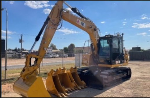
2020 CAT 311F EXCAVATOR