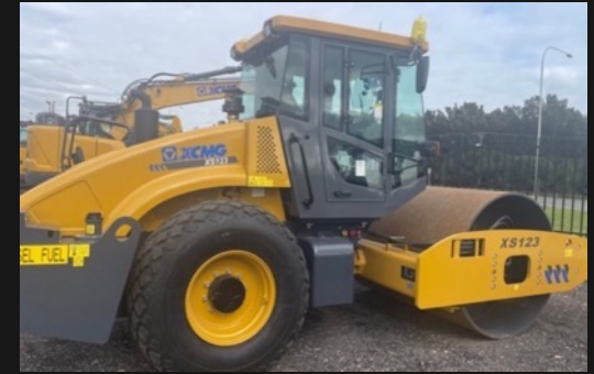
2021 XCMG 12.5T SMOOTH DRUM