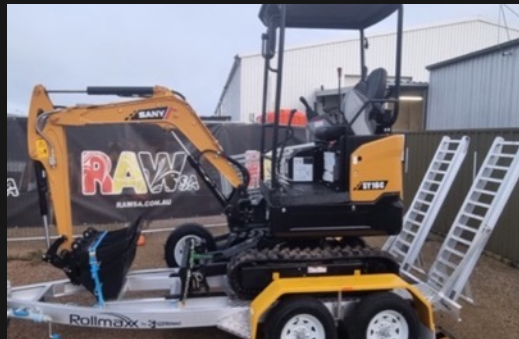
2022 SANY 1.8T EXCAVATOR WITH TRAILER