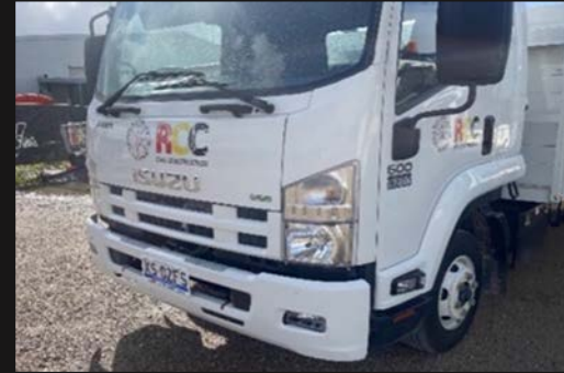
2013 ISUZU FFR600 TIPPER