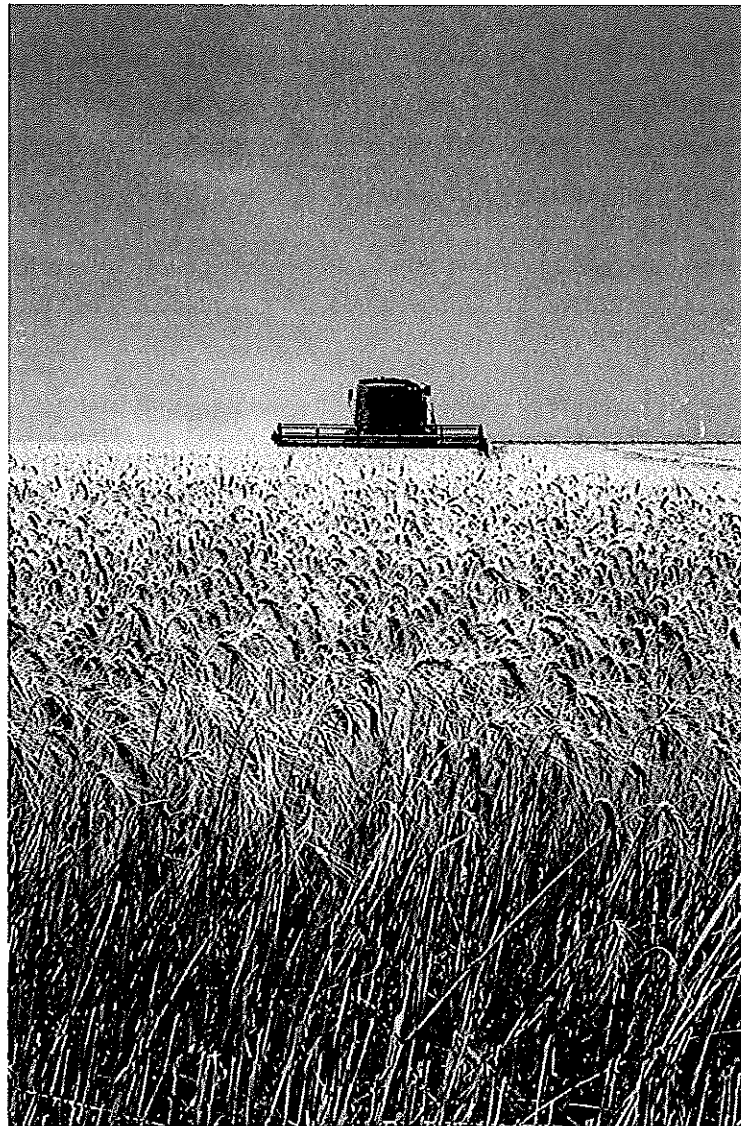
Harvest 4 th Dec 2009 Bumper Wheat crop, the best yield of wheat on our farm to date.