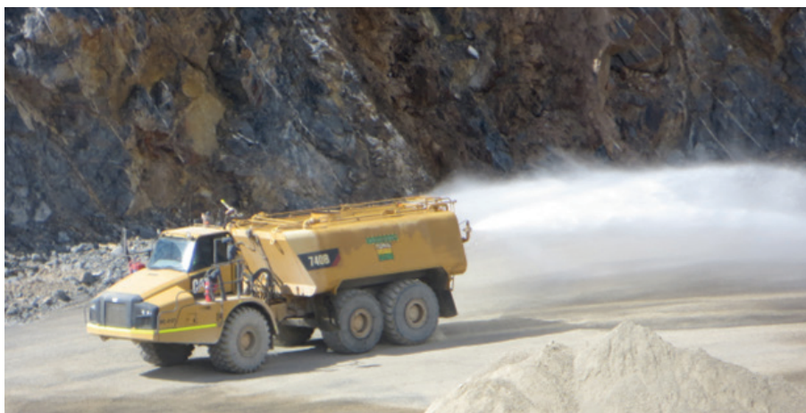
Figure 3 Haul road watering to reduce dust from mining operations.