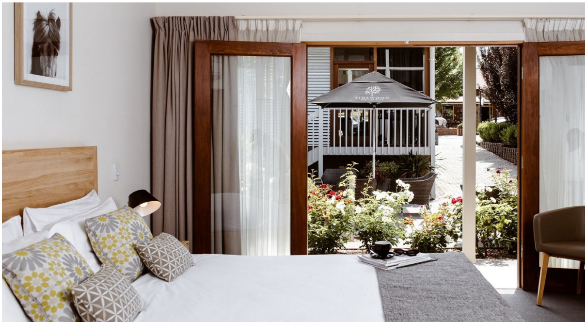
The Manna in Hahndorf will house an EV charging point.

The Haus Group is the largest accommodation provider in Hahndorf and the Adelaide Hills. As such, we attract many interstate, overseas and SA-based travellers who are increasingly aware of the importance of smart and sustainable travel – particularly with fuel costs on the rise.